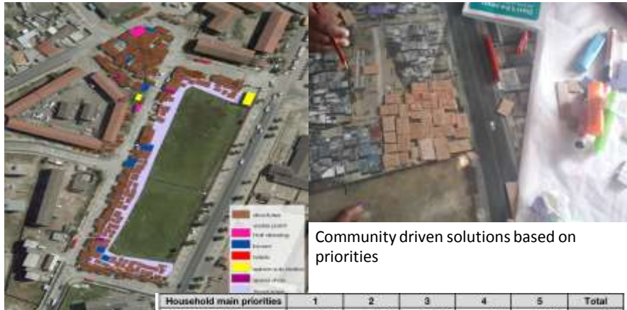
Community driven solutions based on priorities